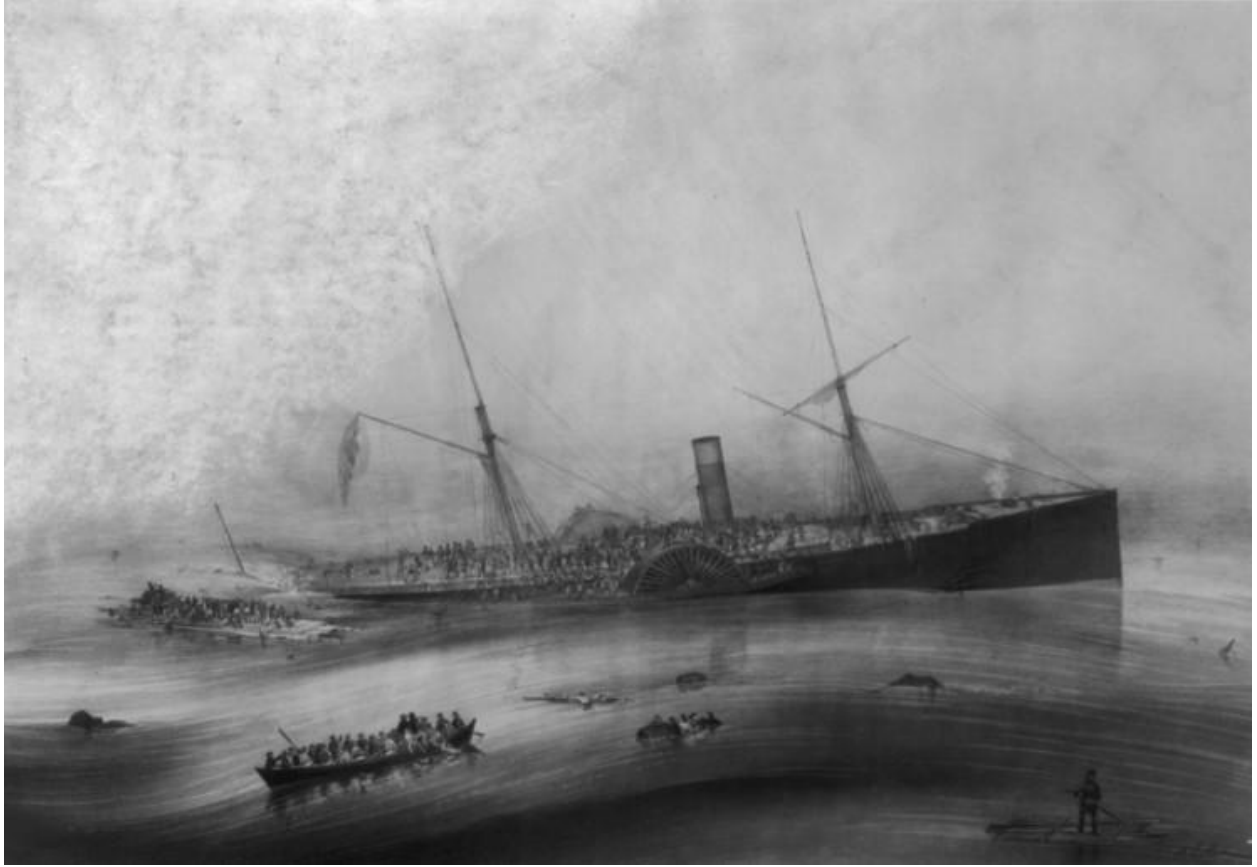
Wreck of U.S.M. Steamship Arctic (N. Currier, Printer, 1854).